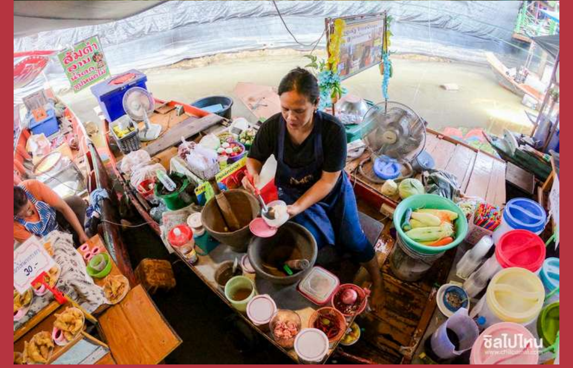
AYOTHAYA FLOATING MARKET