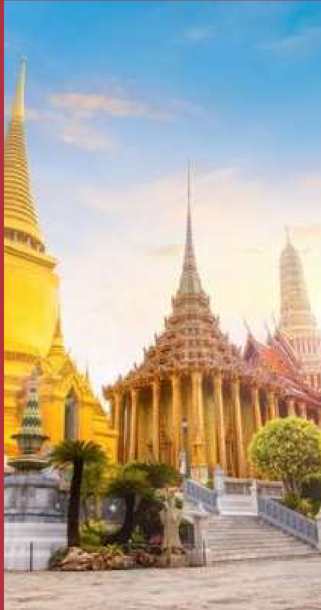
THE GRAND PALACE