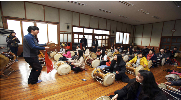
Imsil Philbong village – Traditional Music Experience