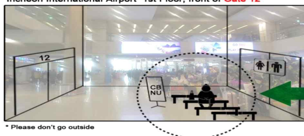
<Welcome Flag> at EXIT 12