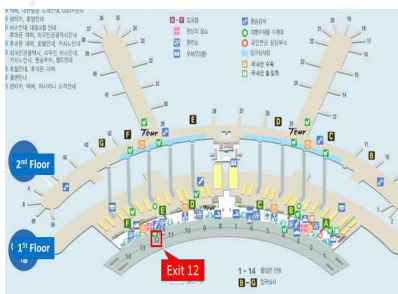
<Map of Airport>

* The Schedule may change depending on the number of applicants.