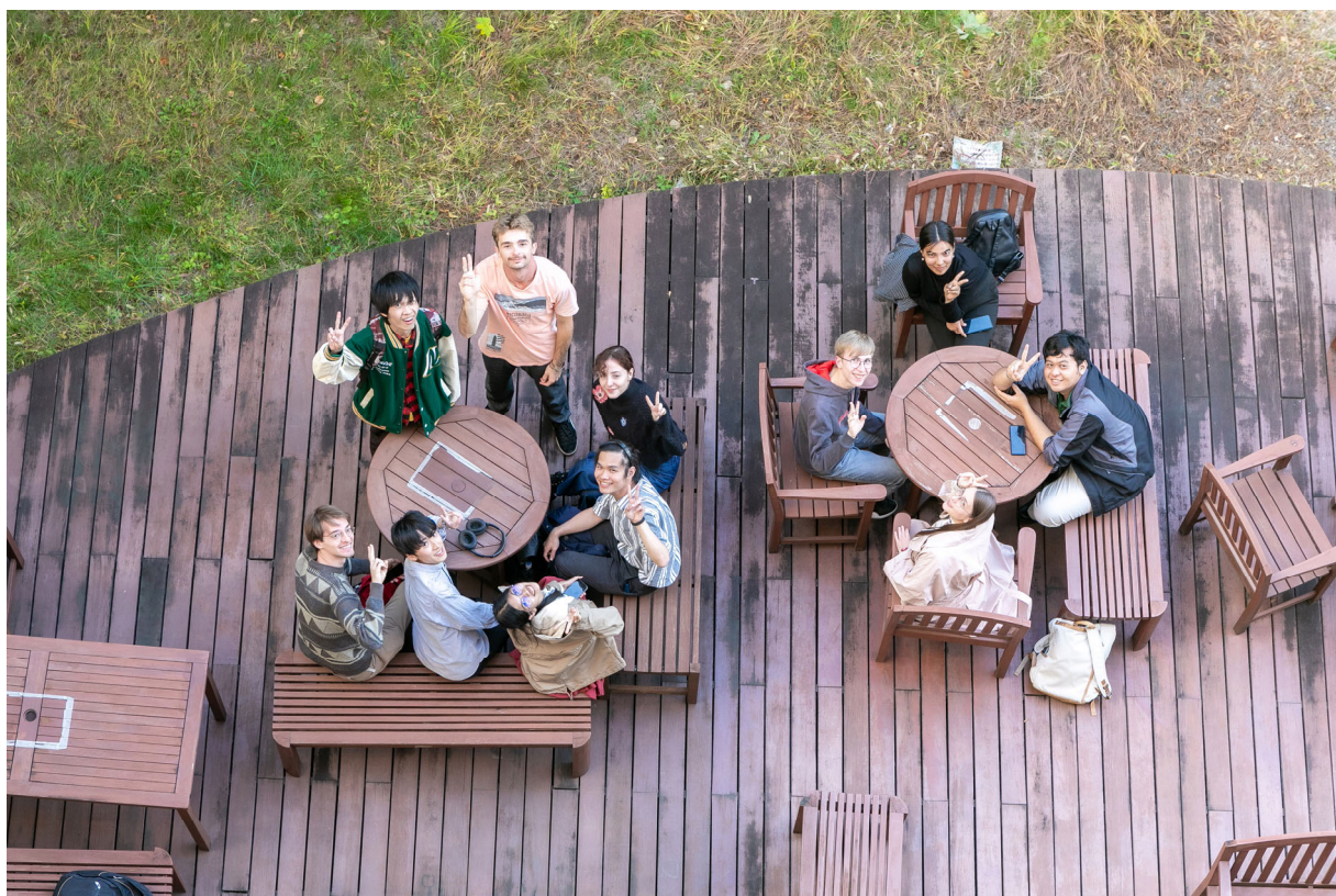
(Scenery of Matsumoto Campus)