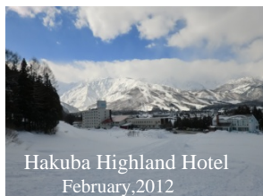
Hakuba Highland Hotel February, 2012

We organized the first and second symposia on Future Challenges for Carbon-based Nanoporous Materials in 2007 and 2010. The researches on carbon-based materials are increasing year by year. Graphene has joined in new nanocarbon families, promoting worldwide researches with the relevance to energy and environmental technologies. Energy situation is rapidly changing; nuclear energy